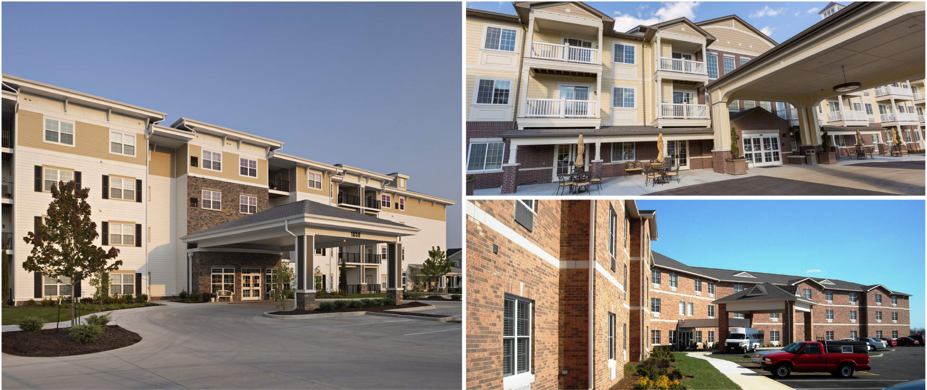
Keystone Place Senior Living, O’Fallon, IL Sycamore Creek Senior Living, Pickerington, OH (top) Cambridge House Senior Living, Swansea, IL (bottom)