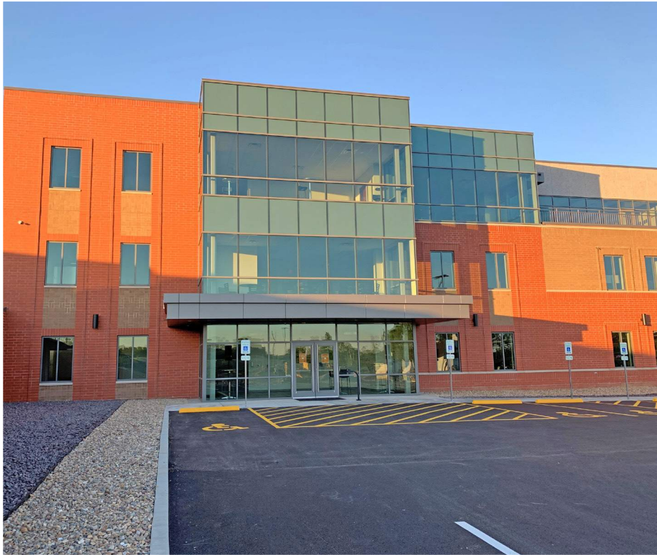
Eleven South Office Building, Columbia, IL