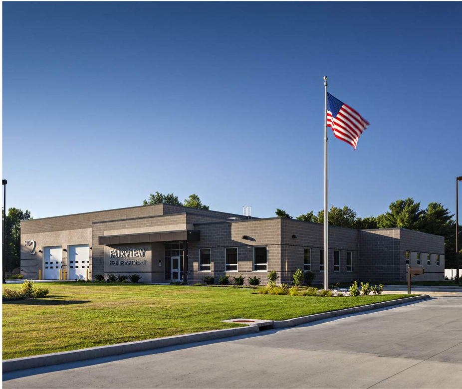
Fairview Engine House #2, Fairview Heights, IL