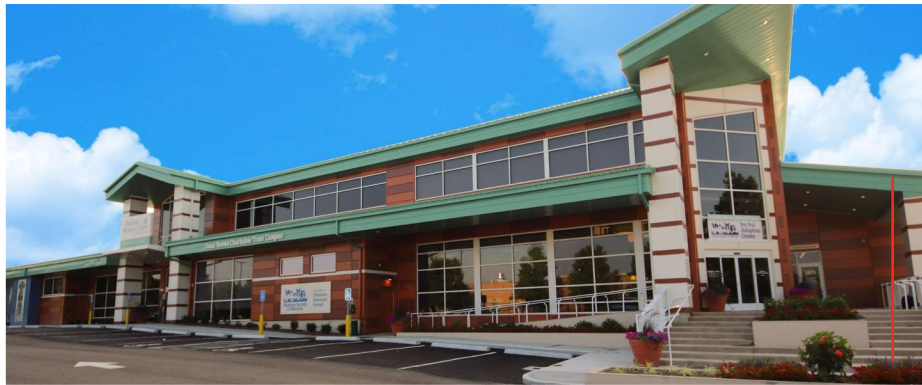
Hobby Lobby, Fairview Heights, IL (top) HSMO Best Buddy Pet Center, Maryland Heights, MO (bottom)

Holland Construction Services has been providing commercial construction services in the St. Louis Metro area and throughout Illinois since 1986. We have built a reputation of integrity that extends from each employee of the company to our clients, subcontractors, suppliers, and the many community organizations we generously support year after year. Our mission is to ensure our clients' total satisfaction with their project, and in the meantime, create and strengthen relationships that will last a lifetime.