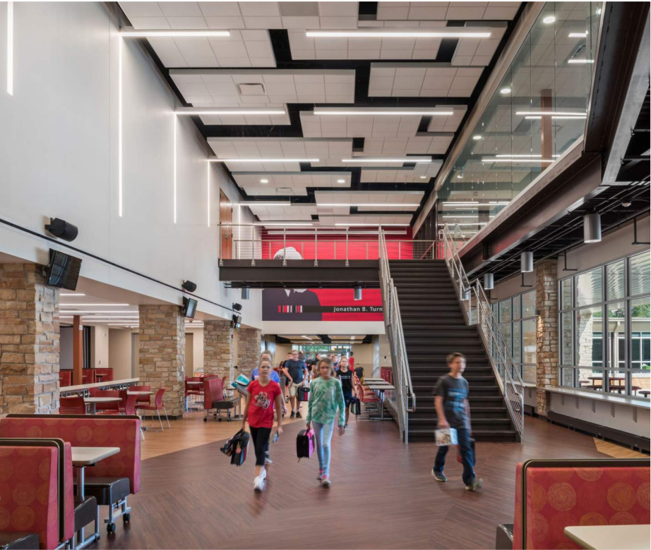
Jacksonville Middle School, Jacksonville, IL