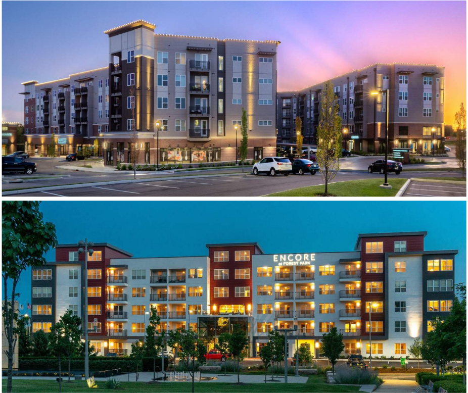
Whispering Heights Apartments, Edwardsville, IL The Villages of Twin Oaks (Mixed Use), Twin Oaks, MO (top) Encore at Forest Park, St. Louis, MO (bottom)

In multi-family construction, matching the client's desired scope of work with the budget is critical. Our vast database of recent, relevant cost history coupled with subcontractor input and our experience allows us to provide accurate up-front budgeting and up-to-date cost opinions throughout the design of the project. We also conduct constructability reviews throughout design to continually improve the project's construction and operating cost efficiencies.