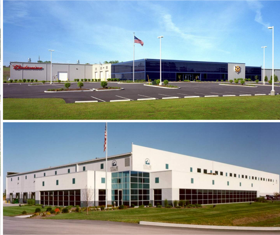
Volpi Foods Processing Plant, Union, MO Grey Eagle Distributors (Formerly Illinois Distributing), Belleville, IL (top) Stellar Manufacturing Co., Sauget, IL (bottom)

Whether it's tilt-up, metal, or concrete block, Holland makes sure our industrial building projects are cost-effective, efficient to run, and aesthetically pleasing. When 90% of the project cost is comprised of subcontractor and supplier costs, the construction manager that can obtain the highest quality and most competitive bids will provide the most value. Holland projects are safe, organized and well managed; we treat people firmly but fairly; therefore subcontractors want to bid our projects.