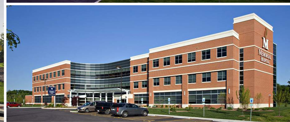
BJC Memorial Hospital East, Shiloh, IL (top) Memorial Orthopedic & Neurosciences Center, Belleville, IL (bottom)

Holland Construction Services has built a reputation for providing outstanding value to health care providers in the St. Louis metro area. When we work for a Hospital or Health System, many times we are invited to stay on as a part of the team. We don't miss schedules, we don't miss budgets, and we are known for having high expectations and delivering a high quality product. Ultimately, the success of each project comes down to people. Ours know what decisions need to be made by who and when.