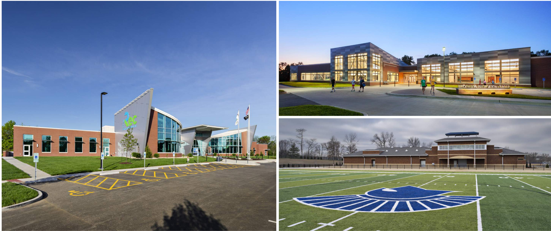
Fairview Heights Recreation Center, Fairview Heights, IL Bridgeton Recreation Center, Bridgeton, MO (top) Missouri Baptist University Football Stadium (bottom)

Holland’s experience with sports and recreation facilities spans nearly our entire existence. We have completed many high-profile recreation projects in the region for private, quasi-public, government, higher education, and elementary/secondary education clients. Building sports and recreation facilities requires a commitment to detail that you can trust Holland to provide.