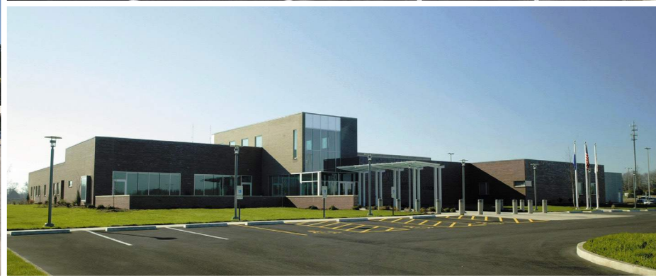
O'Fallon Fire/EMS Headquarters, O'Fallon, IL (top) City of O'Fallon Public Safety Facility, O'Fallon, IL (bottom)

Public entities are scrutinized for every decision made and every dollar approved to be spent. Everything with Holland is open book and there should never be a question about how things are going. We implement communication plans tailored to each project and personal preferences that provide detailed updates during the pre-construction and construction phases. We don't like surprises and we don't expect our clients to have to deal with any either.